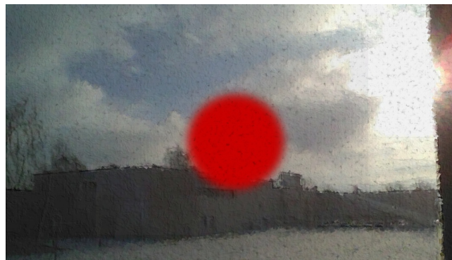
Figure 1: Reconstructed outdoor scene with visually imagined "get directions" command (red circle). Effective resolution is approximately 100 x 80 pixels.

NEURAL INTERACTION THROUGH VISUALLY IMAGINED SHAPES Florian Echtler || University of Regensburg Delivering visual information to the human brain through direct neural stimulation of the optical nerve is now becoming commonplace. However, interaction with such a system is still performed through relatively slow methods such as sub-vocalization of speech or slight muscle movements. In this paper, we present a novel approach to performing interaction via a neural interface: by visually imagining simple geometric shapes such as a circle or a square, the user can issue commands to the system with very low latency. To this end, we adapt existing nanoprobe inserted into the user's visual cortex in order to extract a low-resolution image of what the "mind's eye" sees. After an individual training and calibration phase, simple computer vision methods can then be used to determine the visualized